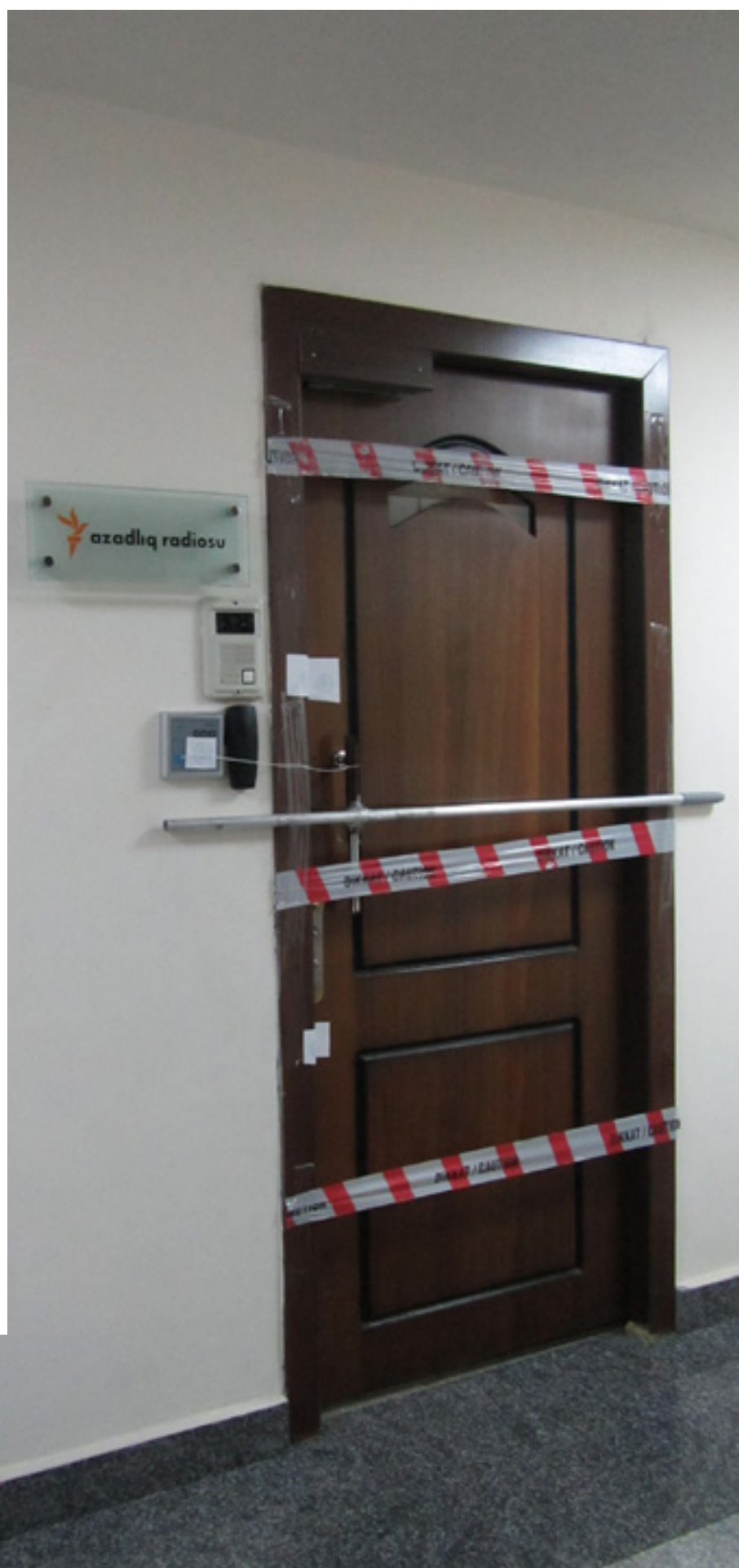
(Above) Radio Free Europe, Radio Liberty's office door remains sealed in Baku since December 2014

The Media Rights Institute, another NGO under attack by the authorities, has provided legal aid to more than a hundred journalists targeted because of their work since 2002. In August 2014, it was forced to cease all activities following a campaign of harassment by the government. The authorities froze the assets and bank accounts of the NGO and its staff, raided its premises and fined the organization 53,000 manats (approximately US$50,000) for failing to register grants. According to the organization's lawyer, the screenshots from the Ministry of Justice website showed that the grants had in fact been duly registered. However, this information disappeared from the website during the investigation.